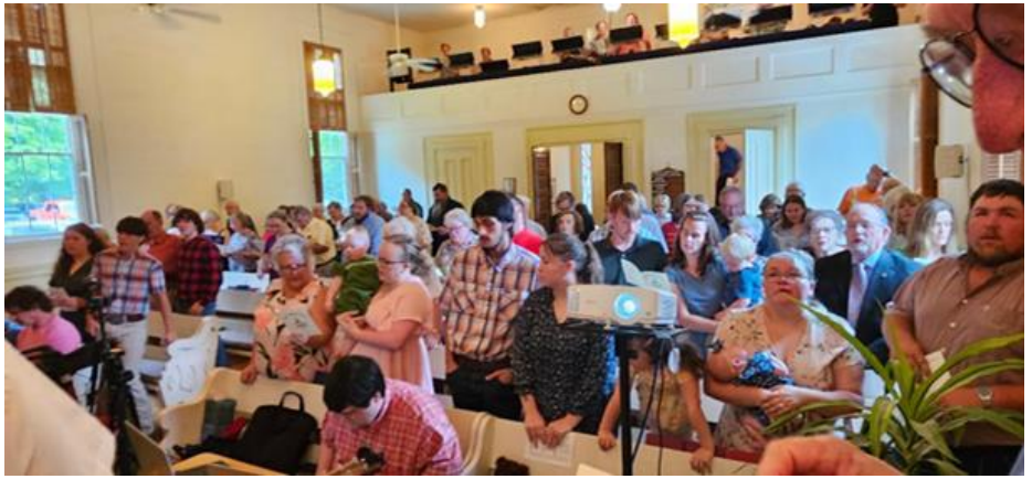
Morning worship service