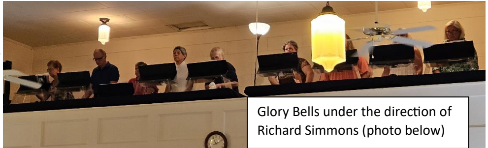
Glory Bells under the direction of Richard Simmons (photo below)

A nice crowd anticipated the dedication of the new kitchen and the lunch that followed.