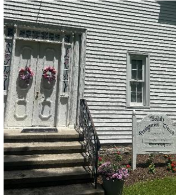
Beautiful spring flowers at Beulah.