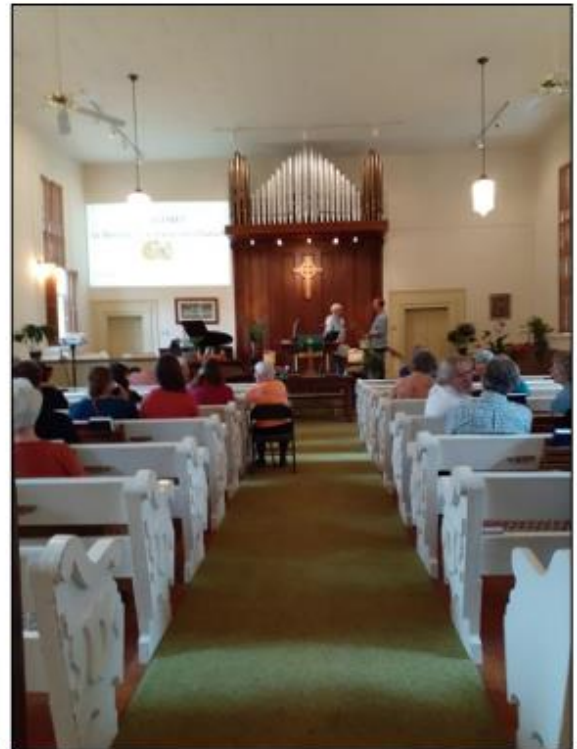
Beulah Presbyterian Church 8740 Mill Gap Road, Mill Gap, VA

Thou shalt be called Beulah... for the Lord delighteth in thee, Isaiah 62:4 KJV