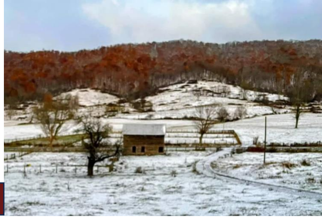
November 1, 2023