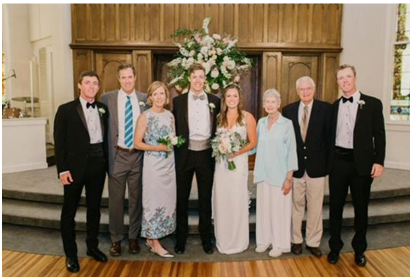
Bucky and Norma traveled to Alabama to share a joyous family occasion, the marriage of their first grandson.