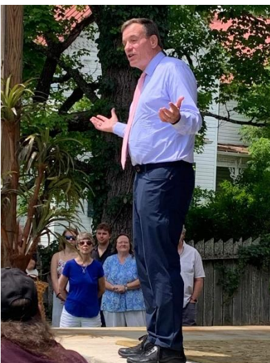
Senator Mark Warner visited Big Fish Cider and answered community questions.