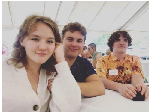
Despite heavy rain that made set up and arrival a bit messy, Taste of Highland 2022 , the annual Highland Center fundraising event, was a huge success. People of all ages came for food, fellowship, music, and a great cause.