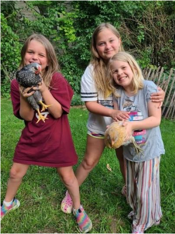
Girls and chickens gone wild