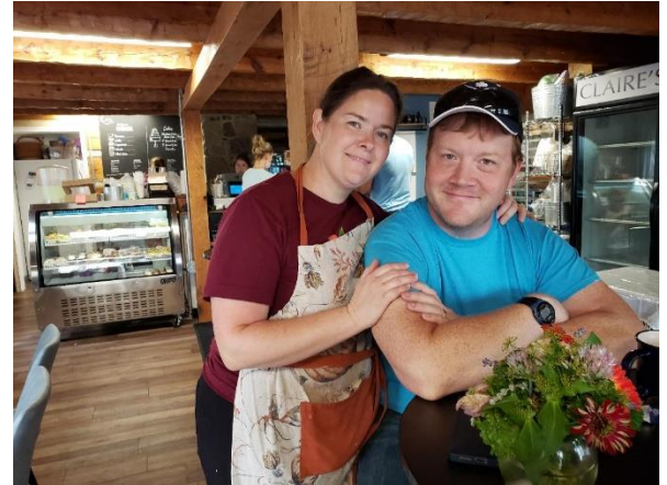
Claire's Cakes and Cafe had a tremendous opening on Main Street last weekend and we wish them continued success.