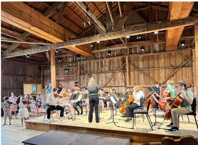
Allegheny Mountain String Project had a concert at Garth Newell